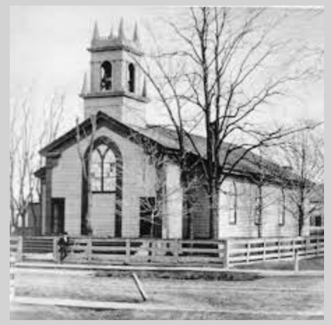
First St. Matthew's Building